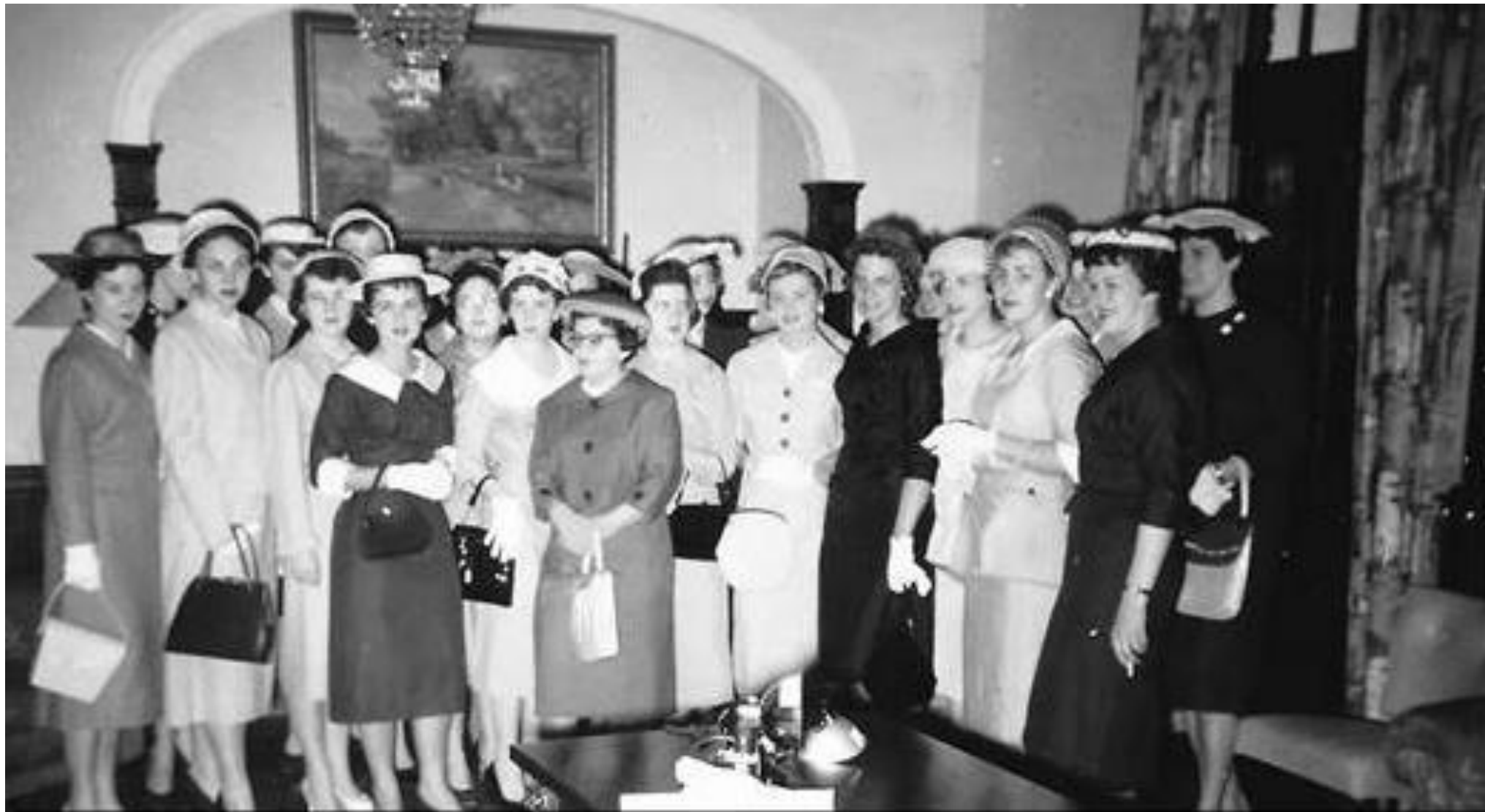
Mother Daughter Graduation Tea Class of 1959