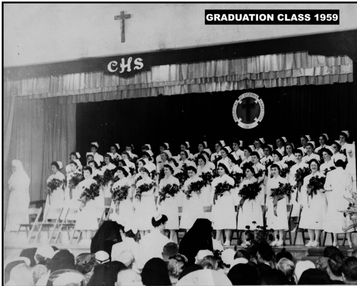
GRADUATION CLASS 1959