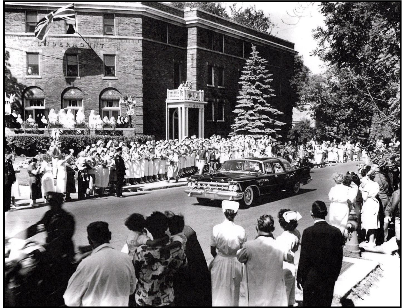
1959 Queen Elizabeth and Prince Philip visit