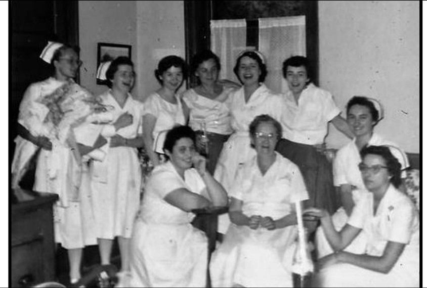
Kitchen Gathering at Marygrove